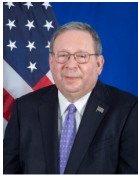
The Honorable David L. Cohen U.S. Ambassador to Canada