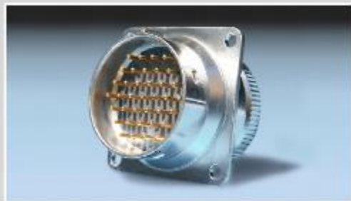
RT9606-37P SAE-AS81703 Series 1 Commercial