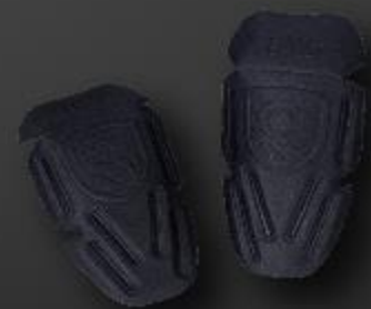
Integrated Knee Protectors (IKP)