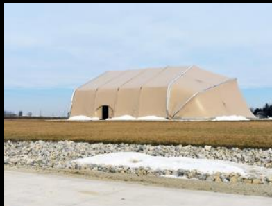
AIR FRAME LARGE AREA MAINTENANCE SHELTER