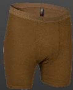
FR Base Layer Boxers