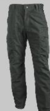
CrewBoss Brush Pant