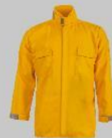
CrewBoss Brush Shirt