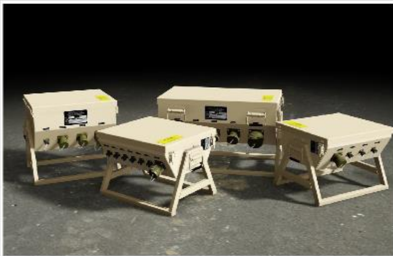
Power Distribution Illumination System (PDISE)

RTI has primarily focused on providing both military and commercial industries the manufacturing of custom design connectors.