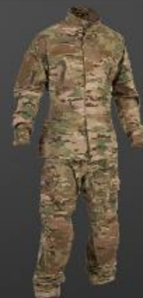
Gen 2 FR Advanced Air Crew Ensemble (AACE)