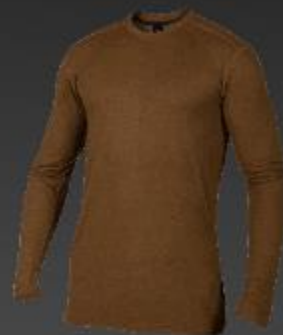
FR Long Sleeve Shirts