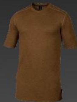
FR Short Sleeve T-Shirts

Serket designs and manufactures protective apparel and personal equipment solutions for those who protect and serve in the Armed Forces and Federal Law Enforcement.