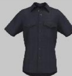
Guardian Short Sleeve Shirt