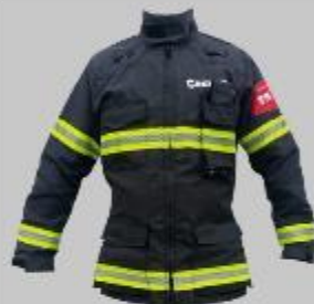
TRES Firefighter Coat - Elite