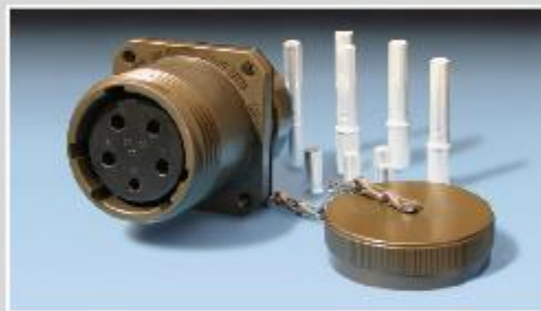
MS90555C32412S Mil-DTL-22992 QWLD Class L