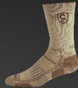
FR Merino Wool Socks