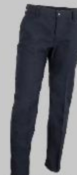
Station Wear Pant