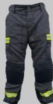
TRES Firefighter Pant - Elite