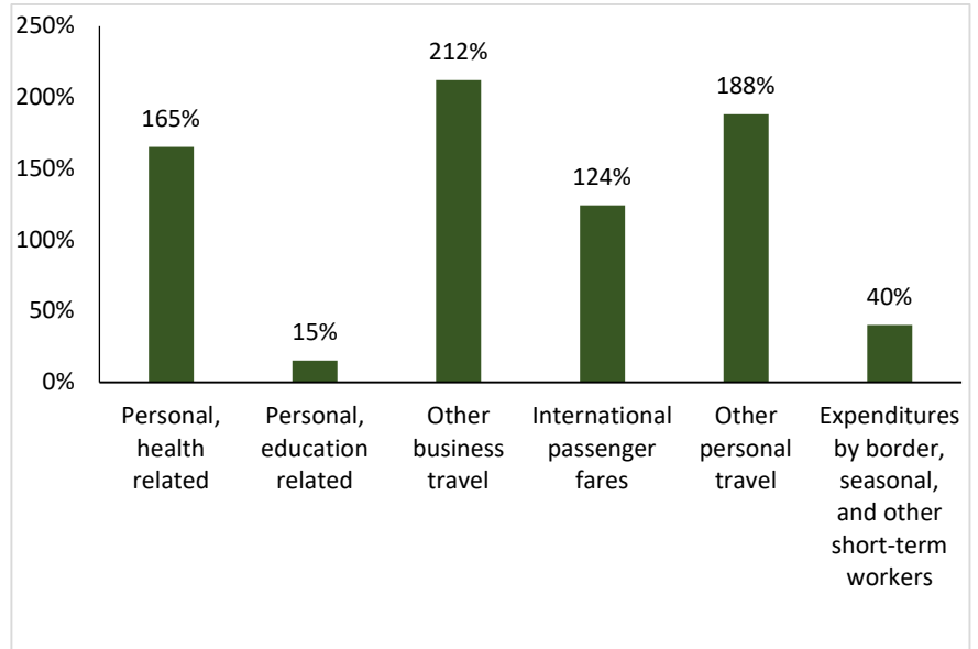
Chart 1: Percent Change in Travel Exports by Component (2021 to 2022)