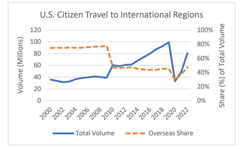
Chart 3: U.S. International Departures